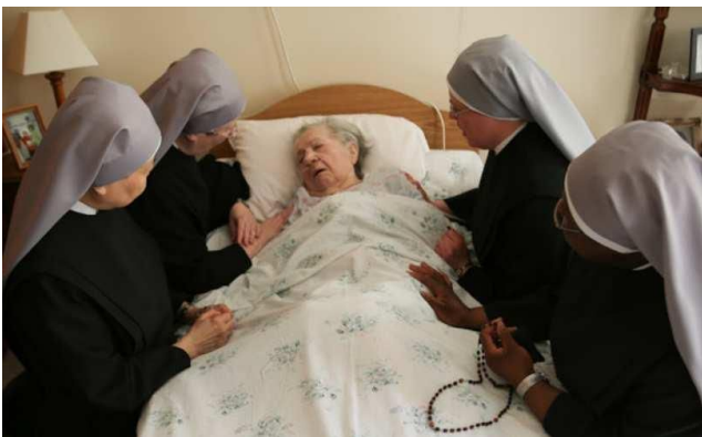
Little Sisters of the Poor

So if your mother, who has Alzheimer's, is not in a state that allows for assisted suicide, you can always take a trip to Washington, D.C., to have her "cared for."