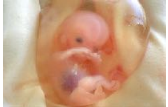
Unborn Baby, 10 Weeks Old VOTE FOR ME

▶ "The most striking change, beyond individual policies, is how unapologetic [Democratic presidential] candidates' tone on abortion rights has become. ...Democrats have said it should be 'safe, legal, and rare.' ...Now, almost every candidate says the next president should actively reframe the debate. Their language focuses on health care, bodily autonomy, and, at times, even the idea of abortion as a positive force enabling women to control their lives and increase their economic security." Pro-Abortion New York Times