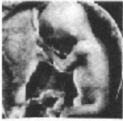
IT'S A CHILD, NOT A CHOICE