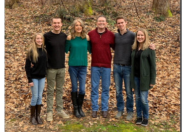
Rep. Thomas Massie & his family

GUEST SPEAKER: HON. THOMAS MASSIE (R) Northern Kentucky Pro-Life Congressman