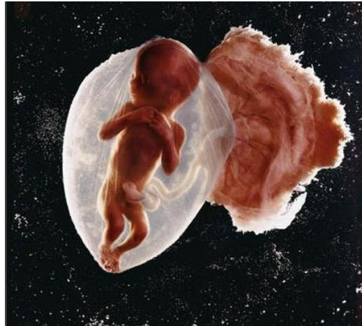
Baby in amniotic sac