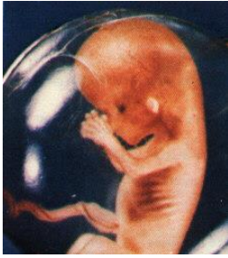
8-week-old unborn child VOTE FOR ME