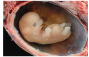
6-week-old unborn child VOTE FOR ME

Pursuant to our long-standing policy of bringing to the public the views (and records) of candidates for public office, on these crucial "Life" issues, NKRTL sent questionnaires to candidates seeking office in the election of May 24, 2022 . After furnishing them detailed information concerning the issues, NKRTL advised them that their response (or the fact of their non-response, which could only be interpreted as unfavorable in that they either oppose its positions or are disinterested in these vital issues) would be published.